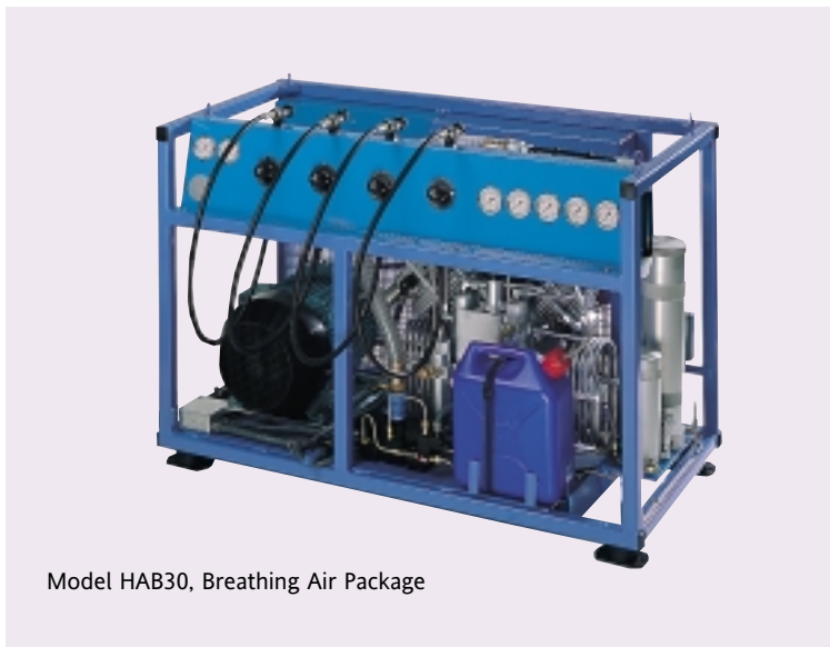
Model HAB30, Breathing Air Package

With over 100 years of experience CompAir sets high quality stands in world-wide compressor markets. Mounted within a strong frame, the highly efficient and modular design of the 'HA' packages makes them especially suitable for both industrial and breathing air markets. These packages have earned a good reputation in their use by fire brigades, dive schools commercial filling stations, military/navy, marine/offshore and general industrial users.